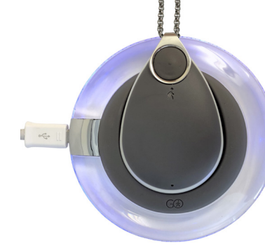
Blue when charging